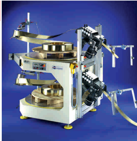
Easy cleaning of the straightening rollers